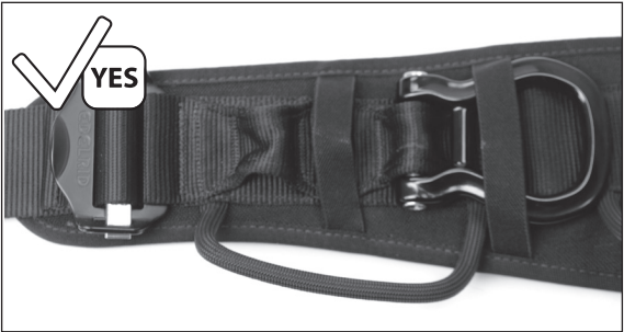
3. Stow away